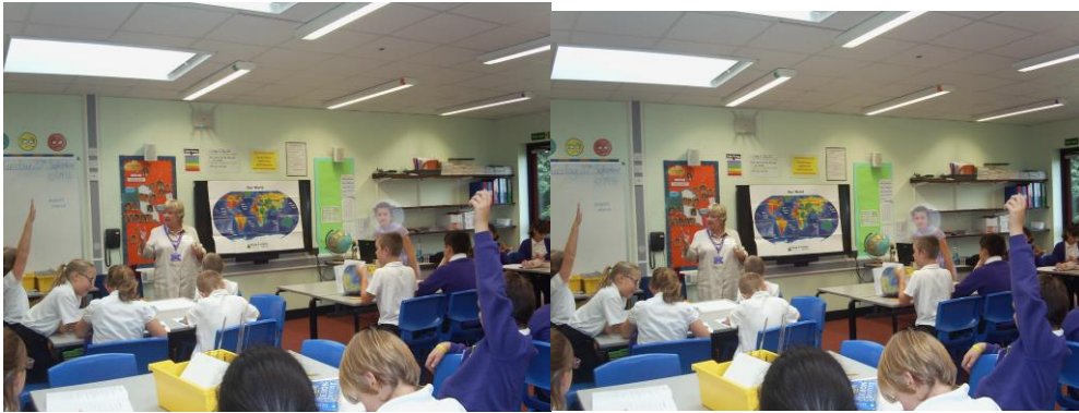
Young Enterprise Day