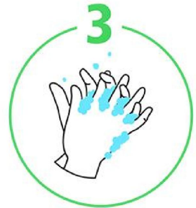
In between the fingers