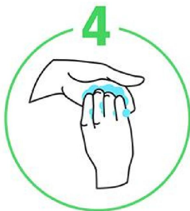
The back of the fingers