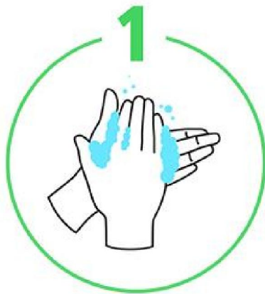
Palm to palm

Wash your hands with soap and water more often for 20 seconds