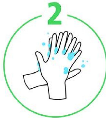
The backs of hands