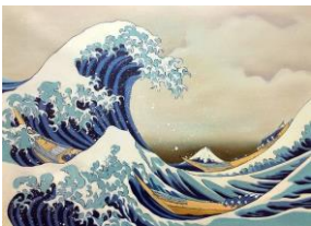
'The Great Wave' by Hokusai

We have learnt about what causes an earthquake and why they then cause tsunamis. We also learned that there are different types of mountains and how they are formed. This week we have been comparing the work of the artist, Hokusai and Van Gogh and given our opinion on them. We have looked more closely at the painting 'The Great Wave' by Hokusai and practised re-creating the colours by mixing primary colours together. Aren't they fantastic!