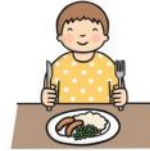
Eat your dinner