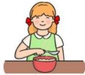
Eat your breakfast