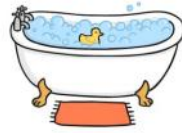
Have a bath