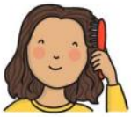
Brush your hair