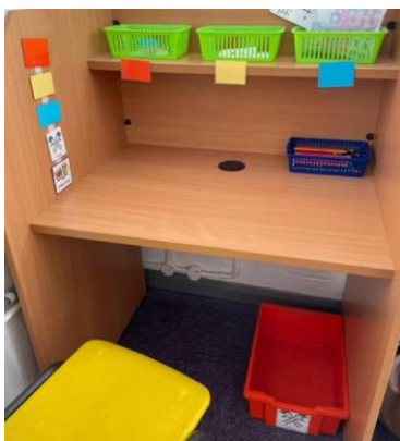
Individual work stations