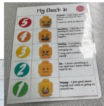
Individualised emotional check ins