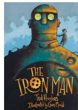
The Iron Man by Ted Hughes